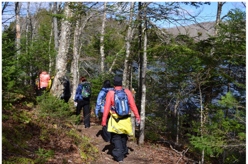
Spring hiking on Earltown Lakes and Portage Trail.

Explore a new trail this summer! To plan your next trail adventure, visit www.colchester.ca/trails . When enjoying your trail adventures, please stay on designated trails, respect other trail users, and keep your dog on leash. Happy Trails!