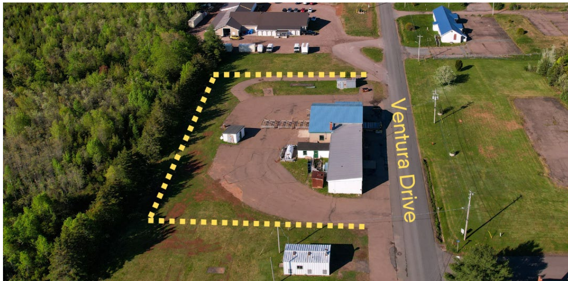
Aerial View -15 Ventura Drive