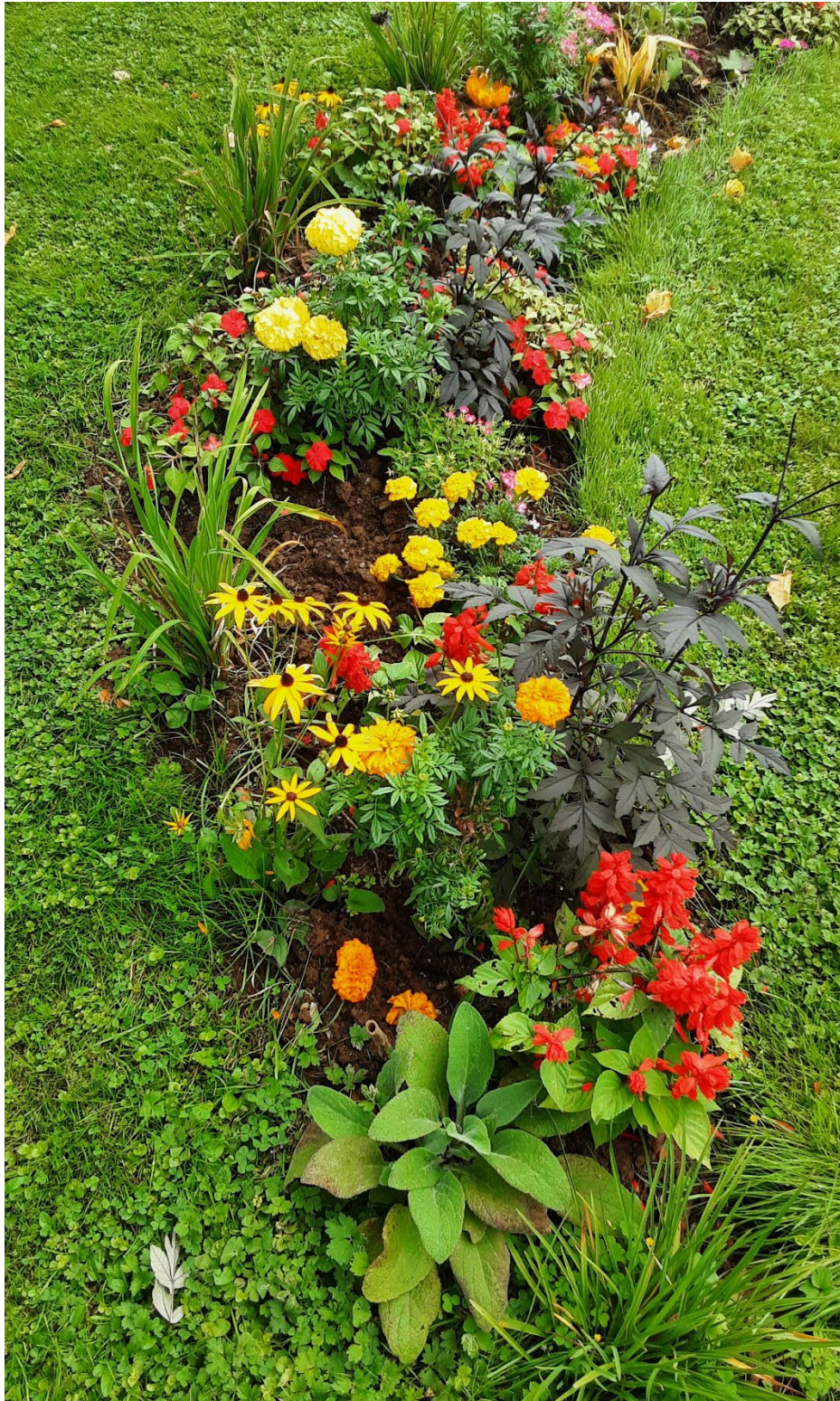
Figure 2: Garden located on PID 20085973 to be reinstated after construction.