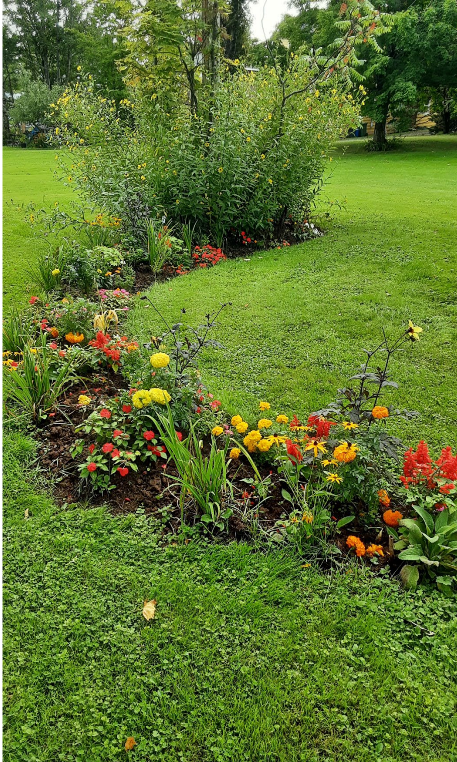
Figure 1: Garden located on PID 20085973 to be reinstated after construction.